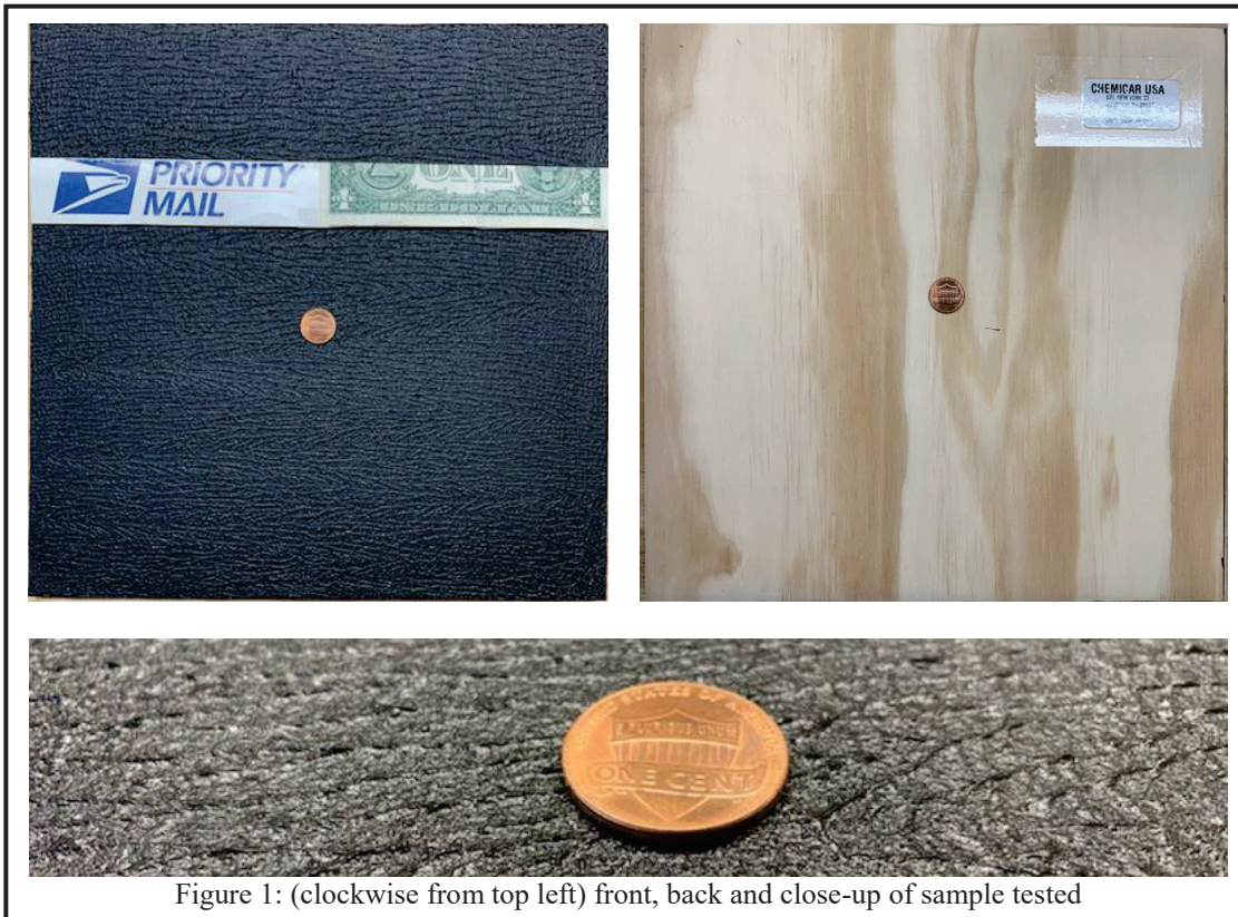
Figure 1: (clockwise from top left) front, back and close-up of sample tested

Figure 1 shows the sample. Red, green, blue, and white color references are included, with a U.S. penny (1/16 inch thick) for scale. The back of the sample is included to aid in positive identification.