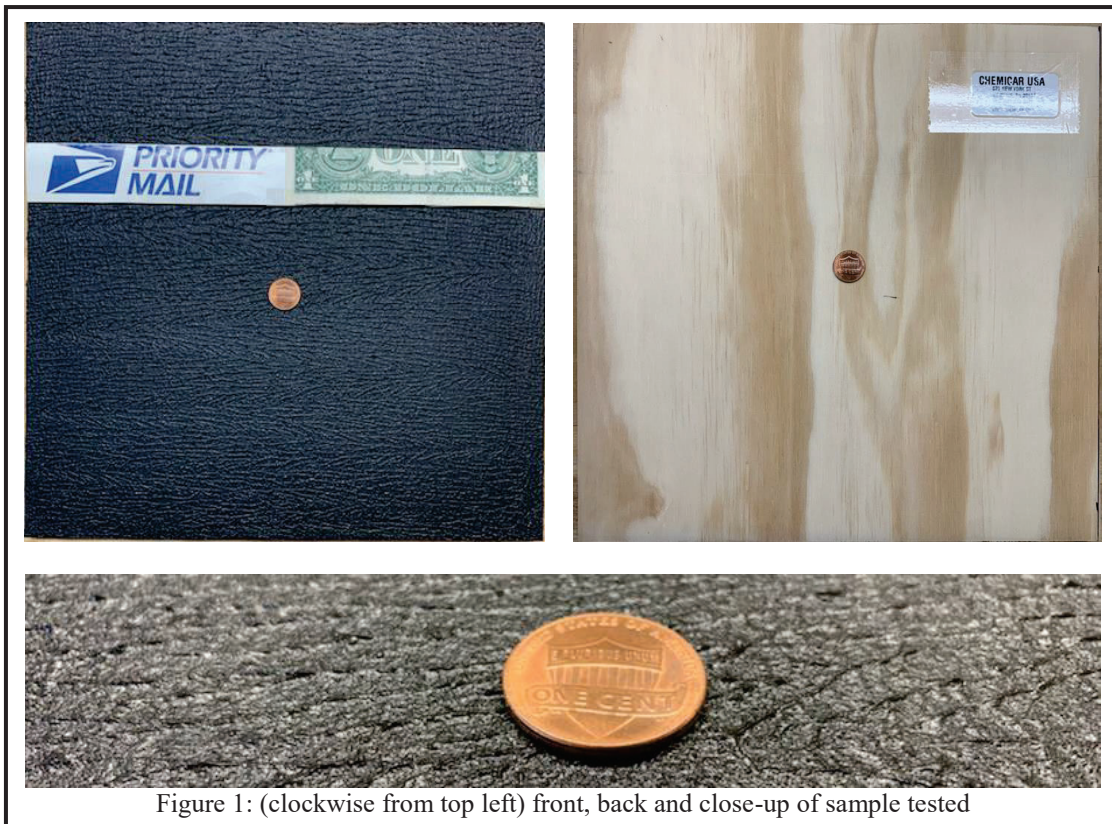
Figure 1: (clockwise from top left) front, back and close-up of sample tested

Figure 1 shows the sample. Red, green, blue, and white color references are included, with a U.S. penny (1/16 inch thick) for scale. The back of the sample is included to aid in positive identification.